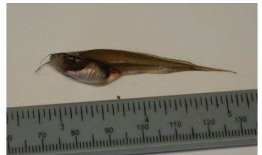
An African clawed frog tadpole.

Native green and bronze frogs have two parallel lines of raised glandular skin between the back and sides; the bullfrog does not have these features. Also, native frogs tend to inhabit water only to breed and otherwise live on land near water. Native frogs are smaller, rougher-textured, and less plump-looking than African clawed frogs. Look up native species (Pacific treefrogs, red-legged frogs, Columbia spotted frogs, Oregon spotted frogs, Cascade frogs) for more distinguishing details.