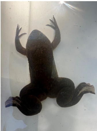
An adult African clawed frog.