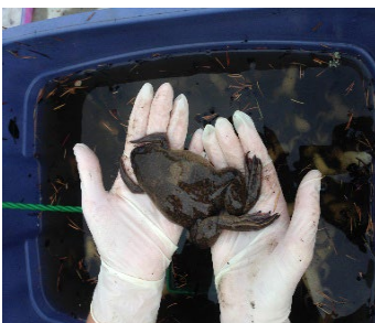
An adult African clawed frog.