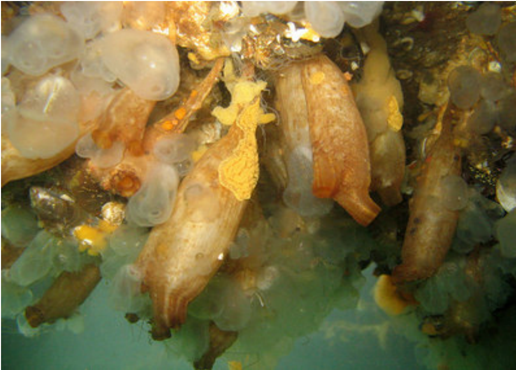
Styela Clava photograph courtesy of Janna Nichols